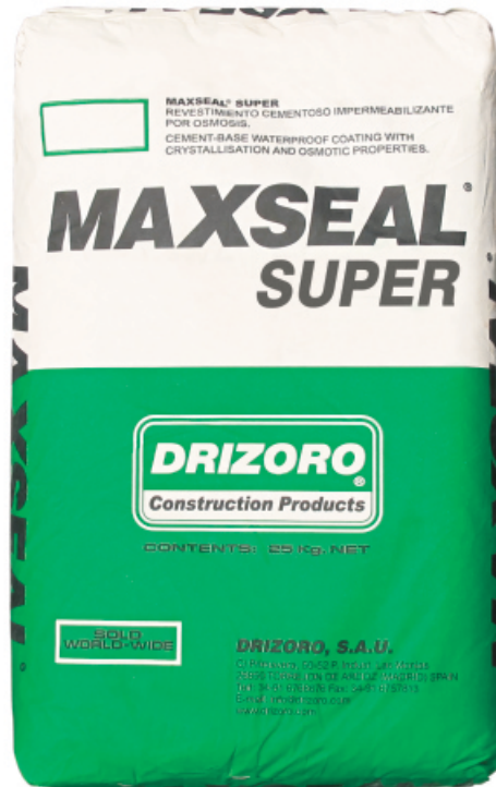
Product / sản phẩm: MAXSEAL SUPER